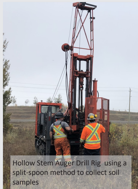
Hollow Stem Auger Drill Rig using a split-spoon method to collect soil samples

The Environmental Technicians will also be participating in a comprehensive training program to hone their skills and to ensure their local communities are receiving quality environmental updates regarding the mine's construction activities. The training will be conducted on site by a third party consulting firm once COVID 19 restrictions allow for more personal interactions.