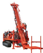
P3 Exploration Update