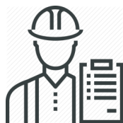
P2 Project Update

On page 4, you'll see a detailed update on planned field activities to prepare for early-works.