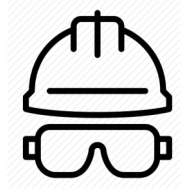
P6 Safety Share