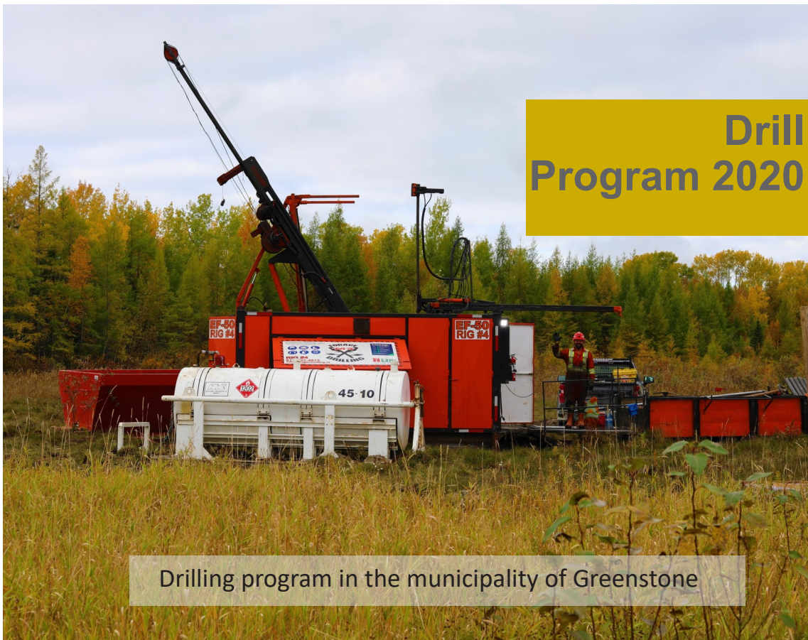
Drilling program in the municipality of Greenstone