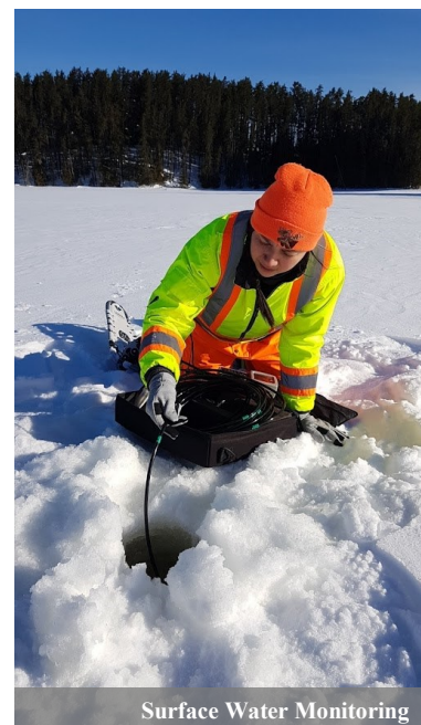
Surface Water Monitoring