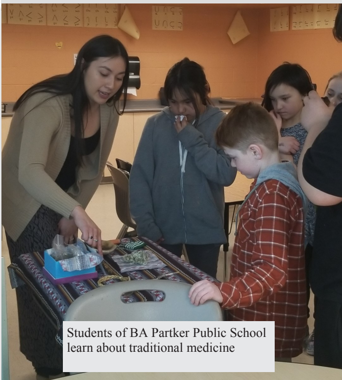
Students of BA Partker Public School learn about traditional medicine